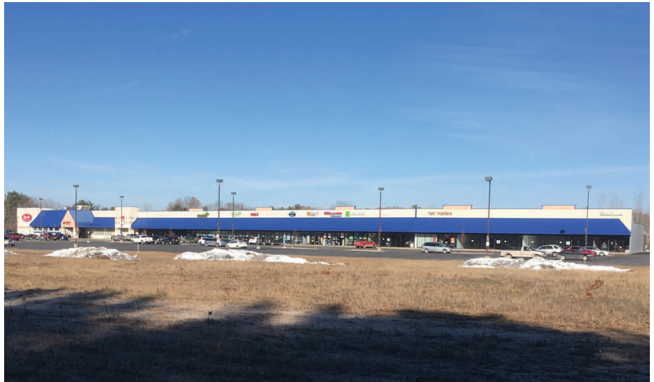
Center Anchored by Grocery Store